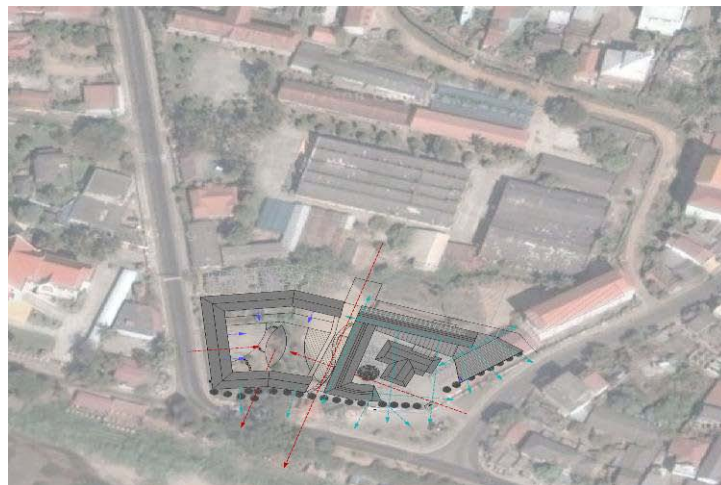
LANITH school consists of the buildings located on the right side of the site and the PPP hotel is the building located on the left side of the site.

Estimated Start-up Cost: US$ 12.5 Million